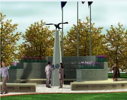
Rendering of Memorial Design

Memorial giving opportunities are also available. Please contact us if you are interested in contributing to this worthwhile project to recognize all veterans who have honorably served. Please join in this great opportunity to make a lasting impression in Waterford Township.